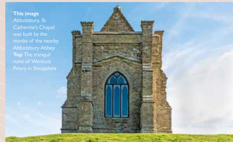
This image Abbotsbury, St Catherine's Chapel was built by the monks of the nearby Abbotsbury Abbey Top The tranquil ruins of Wenlock Priory in Shropshire

To plan your walks and to download maps, go to the Members' Area of our website at www.english-heritage.org.uk/magazine