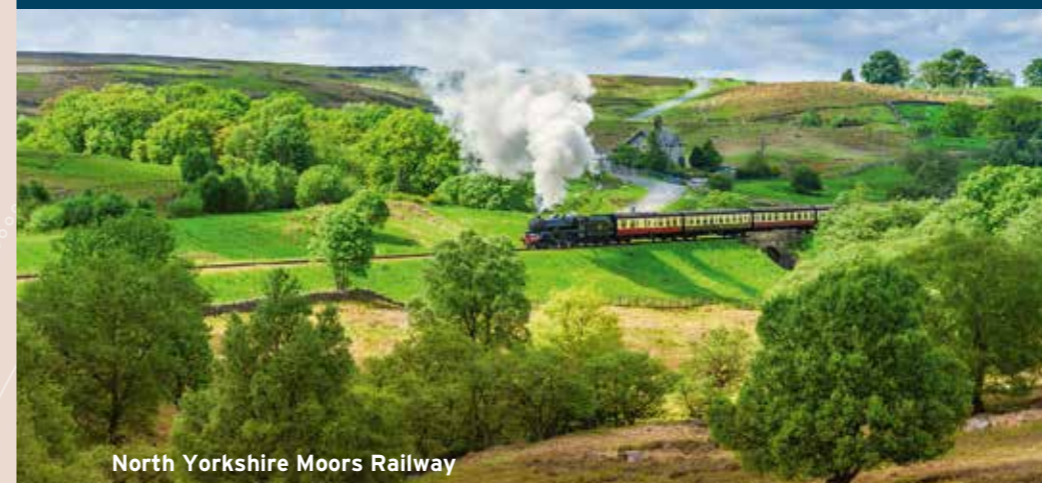
North Yorkshire Moors Railway